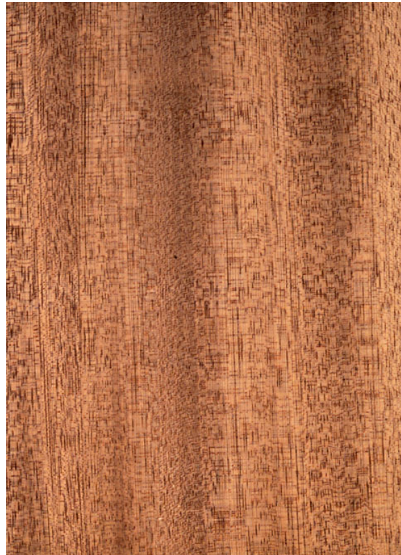
Wood surface of Sipo (radial section)